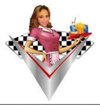
Jovis Diner San Bernardino, California